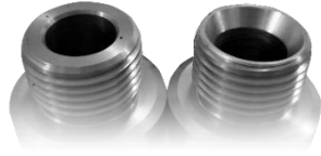
FLAT SEALING CONE SEALING