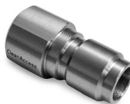
1/4" INTERNAL THREAD