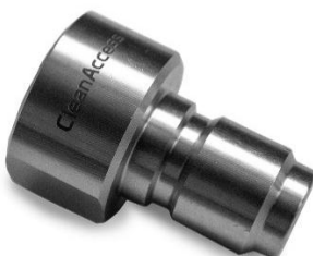
1/2" INTERNAL THREAD