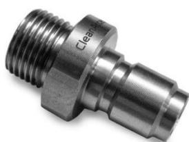
1/2" EXTERNAL THREAD